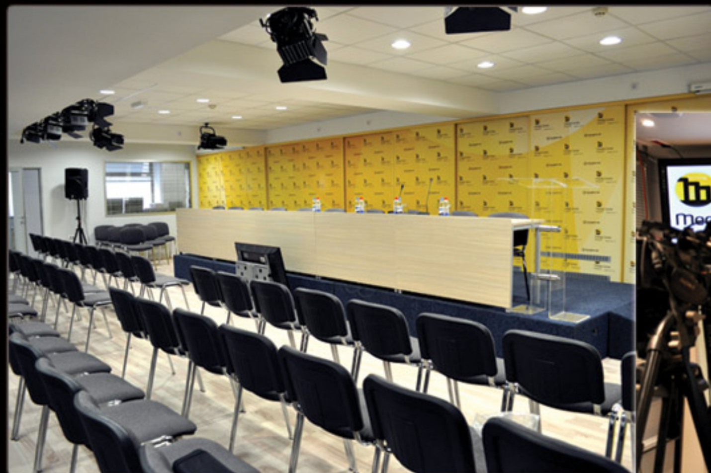
New Hall, 1 st floor 100 seats