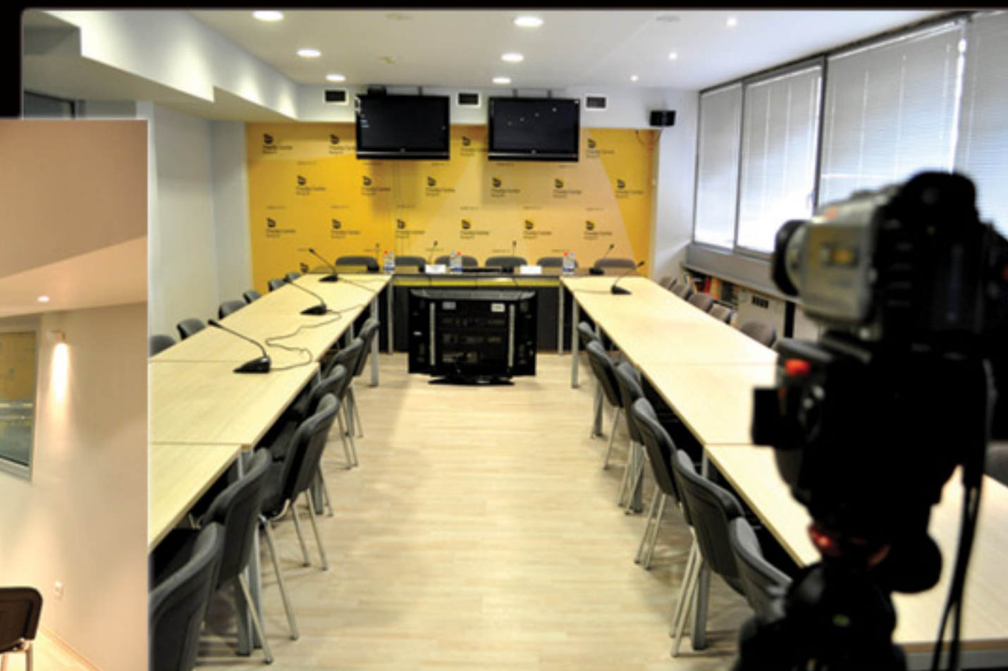
Secondary Hall 40 seats

More than 400 m 2 - three fully equipped conference halls - cafe