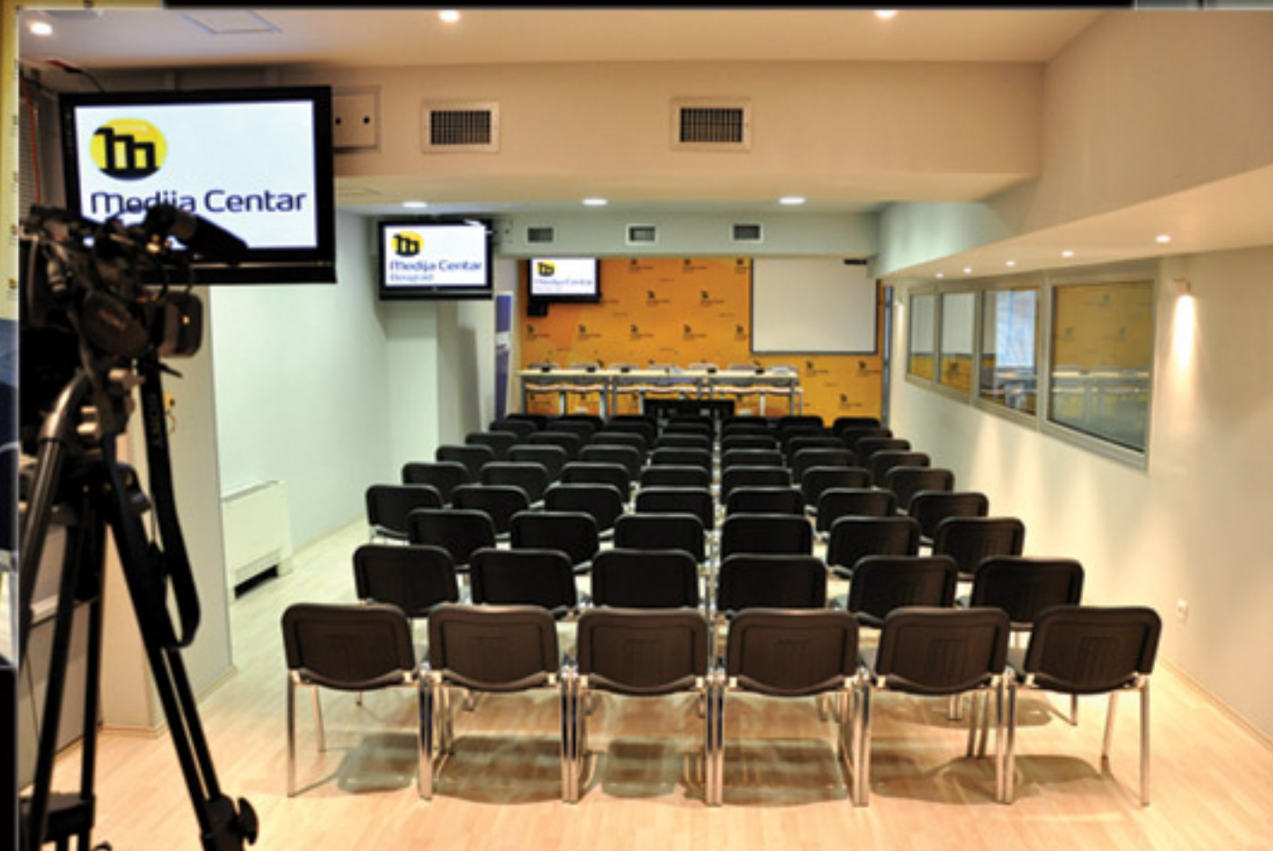
Main Hall 60 seats